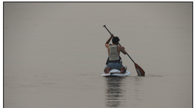
Students from the Kelowna campus enjoyed a day on the water as part of orientation week activities in September.