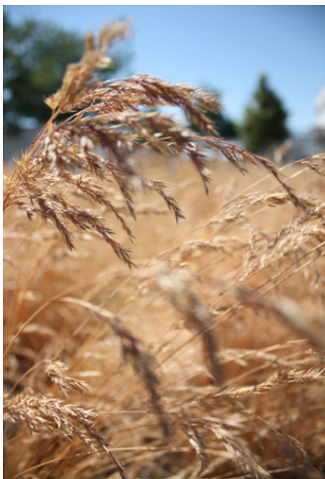
Kelowna Campus - Summer 2010