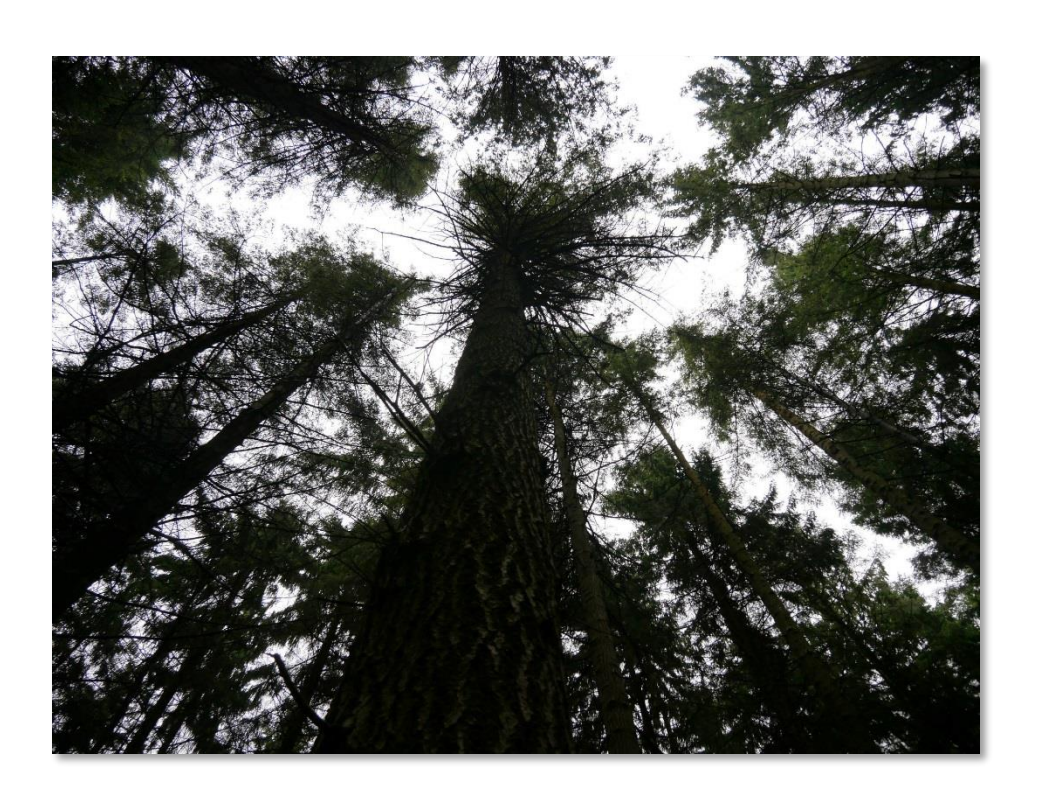
An Examination of Sustainable Non-Profit Practices within the Central Okanagan