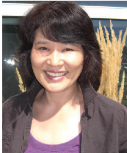
Sun Condy Korean students