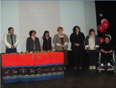
Recent Aboriginal graduates.