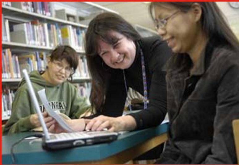
College staff helping our students.