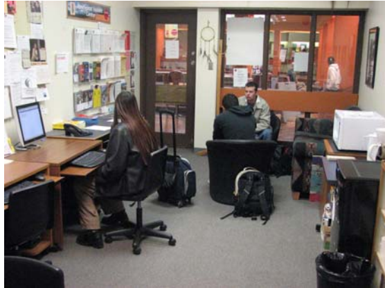
Students in the Aboriginal Student Centre, KLO Campus

In addition to counseling, financial awards, educational advising and disability services, these services include an Aboriginal