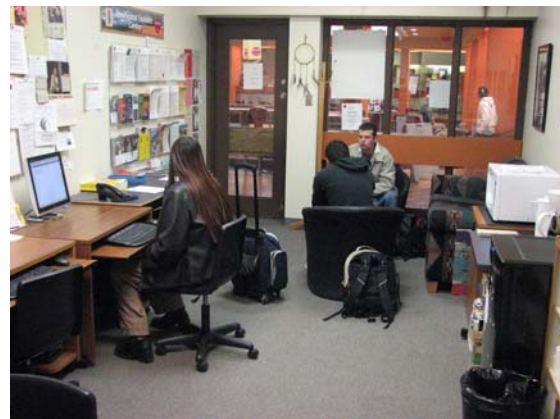
Students in the Aboriginal Student Centre, KLO Campus

Aboriginal Access and Services, or Aboriginal Services for short, is a branch of the Student Services department. Aboriginal Services seeks to enhance the participation and success of Aboriginal students at OC.