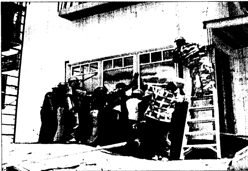
Teamwork helps install All Weather Windows at the Home For Learning