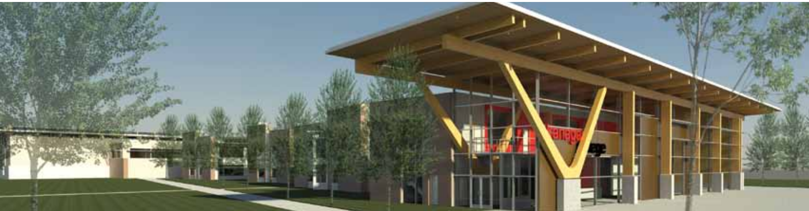
CEI Architecture Planning Interiors

The Okanagan College Centre of Excellence in Sustainable Building Technologies and Renewable Energy Conservation, now under construction in Penticton, will play a fundamental role in keeping young people and future leaders in the region. If the Okanagan is to grow and prosper we need to address the fact it has a growing aging population and will experience a larger labour shortage than other parts of the province in the next decade. Statistics also indicate a trend of 19 – 26 year olds leaving the Okanagan Valley for advanced education or job opportunities – many of them never return. The Centre of Excellence is an answer to the challenge.