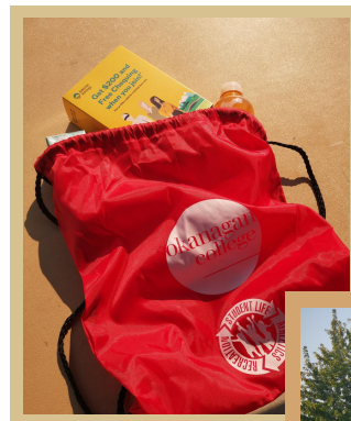
Kelowna welcome back packs ready to be picked up at the walk/drive through event Sept. 8.